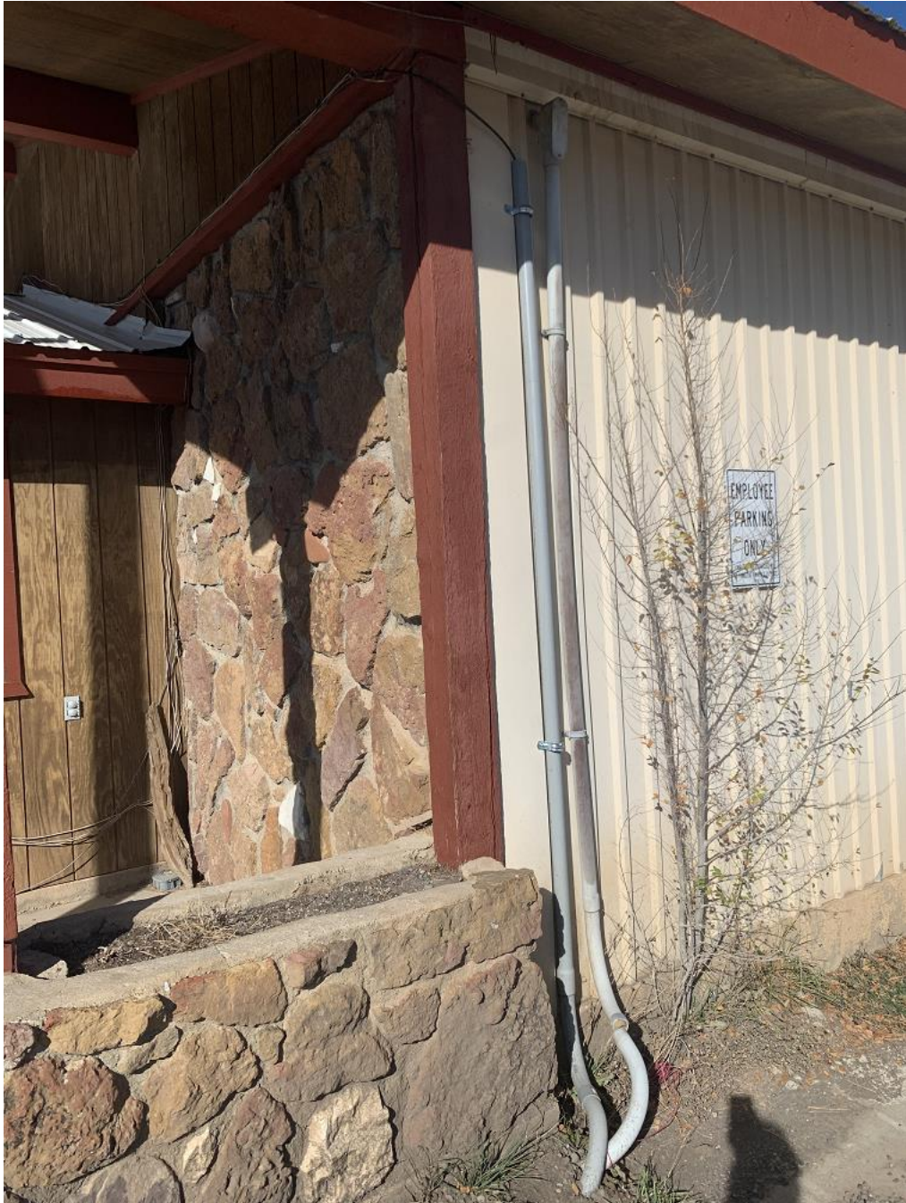
Figure 2: Extension Building Fiber - Not in Conduit